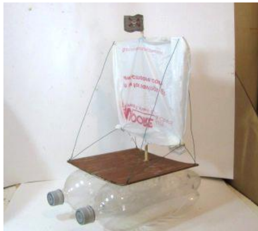
bottles/ twine/plastic bag