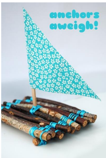
Sticks/elastic bands/ material